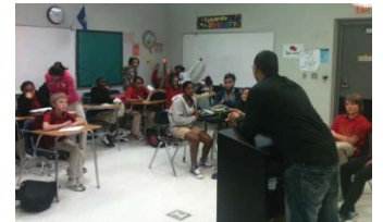
Vets talking to students