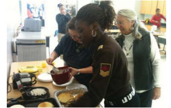
Kids making pancakes